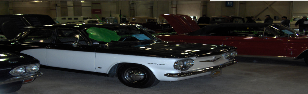
CCRC at Autorama 2019 – sorry there isn't room for all photos!